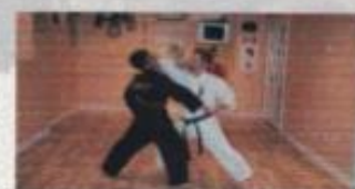
Counter attack: Step forward Jodan hiji uchi age