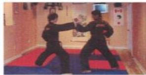
Attack one: right oi zuki Defense one: left uchi uke