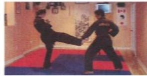
Attack two: right mae geri chudan Defense two: left gedan barai