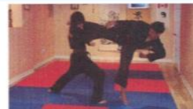
Counter: grab the attacking hand (right hand) and (whilst holding) deliver right chudan mae geri and right jodan mawashi geri