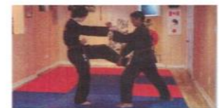
Attack: right jodan oi zuki and left chudan mae geri Defense: left jodan uchi uke and right gedan barai