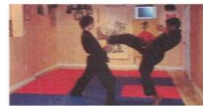
Counter attack: right chudan mae geri then right jodan mae geri