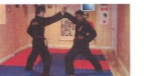
Attack: right shuto uchi to the collarbone (stepping forward, front stance) Block: right shuto age uke (stepping backwards, front stance)