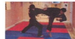
Counter attack: right chudan mae geri then right jodan mawashi geri