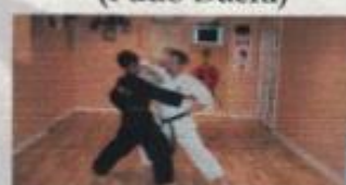
Counter attack: step forward Jodan hiji uchi mae