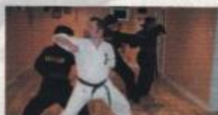
Counter attack: counter clockwise spin Jodan yoko Hiji uchi (Fudo Dachi)