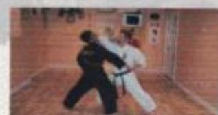
Counter attack: Step forward Jodan hiji uchi age