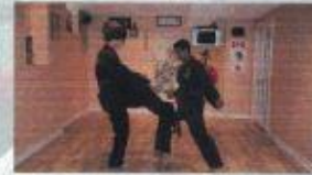
Counter attack: Right kin geri