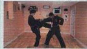
Counter attack: Left chudan mae geri