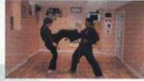
Counter attack: Right jodan mae geri